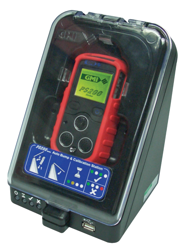
Coloured 'rubber boot' for multi-site or multi-application working (7 colours available)

To complement the Personal Surveyor product line, Teledyne has developed a compact, robust and easy to use Auto Bump & Calibration Station that can provide full bump and calibration options. Data transfer is facilitated using a USB memory stick with Standalone software that is simple to set up and customise based on end users' specifications. Standalone, PC, and ethernet versions are available.